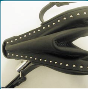
Hand made padded bellows