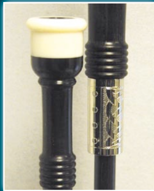
Imitation Ivory Tops