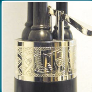
Drone cut-off switch