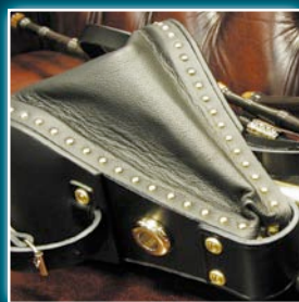
Bellows with gold fittings