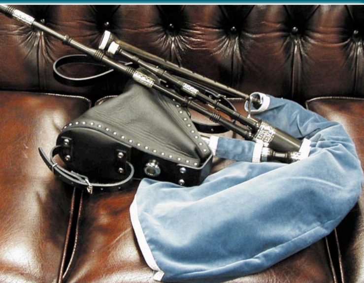
Bellows Blown Border Pipes in A – BB/BPD4