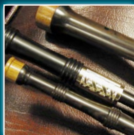
Mopane and Gold