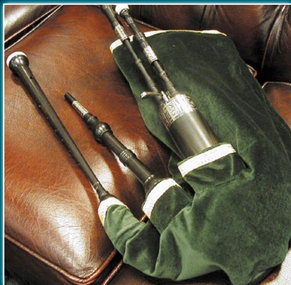
Mouth Blown Small Pipes in A – MB/SPD4